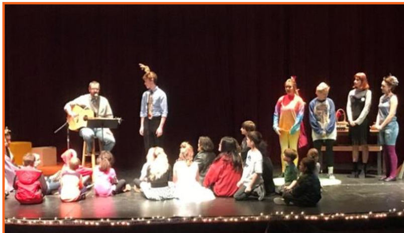
Thespian Holiday Spectacular (December 15)