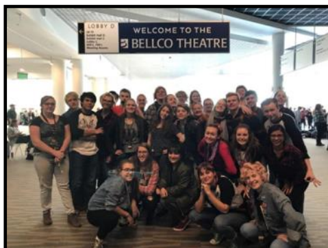
Thespian Convention (December 7-9)