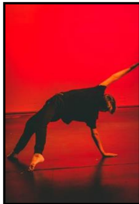
Dance Concert and One Act Performance (Dec. 1-2)